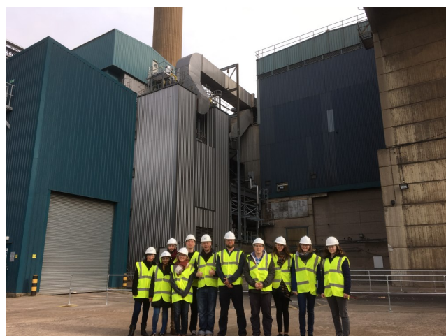
Students on a visit to The Eastcroft Energy from Waste Centre

A group of PhD students from the CDT in Sustainable Chemistry and Synthetic Biology Research Centre DTProg visited Eastcroft Centre. The visit involved a presentation by FFC Environment, the company that operates the facility, and a tour with plenty of opportunity to ask questions and find out about the centre.